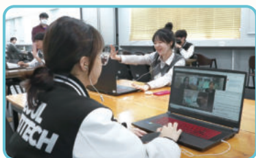
Exchanges during class through small group activities