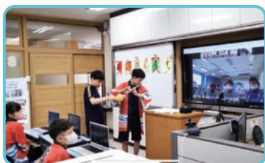
Introduction of traditional musical instruments by special class students in Korea and Japan