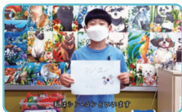
Self-introduction in the counterpart country's language