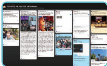
Sharing daily routines (Vlog)