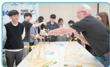
Korea-New Zealand high school students' International Joint Class on Use of Coding