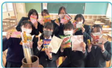
Exchanging "culture boxes" and handwritten letters